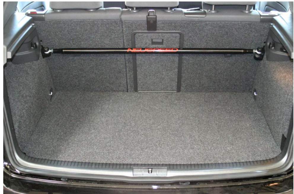
FINISHED INSTALLATION WITHOUT DIAGONAL BAR

©2008, NEUSPEED®. All rights reserved. Reproduction in whole or in part prohibited. DOC.80.10.91 Rev. 08.01.08