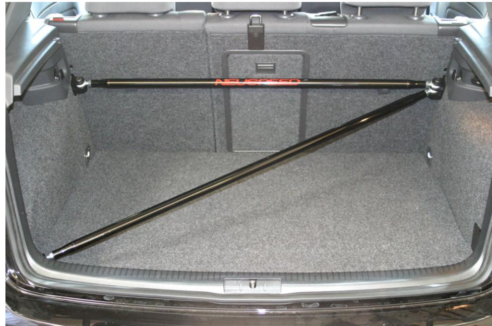
FINISHED INSTALLATION WITH DIAGONAL BAR

10. Thread M10 jam nuts onto ball-joints and screw into tie-bars. Loosely mount cross-bar and diagonal bar using supplied shoulder bolts. Now tighten ALL bolts and ball-joint jam nuts.