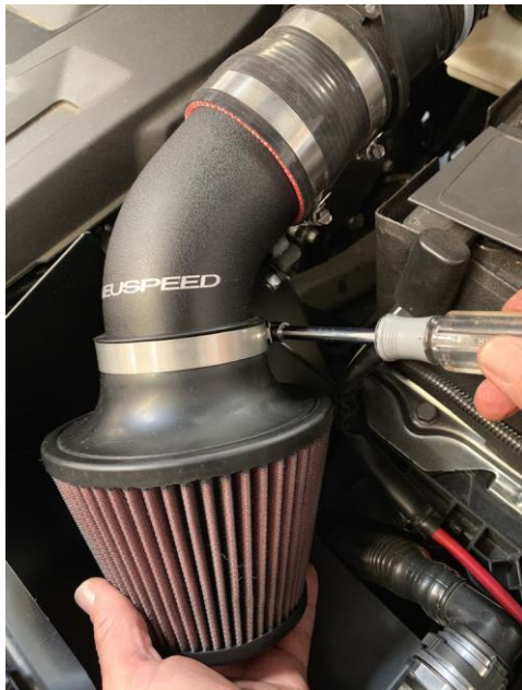
15. Install NEUSPEED Filter, adjust filter to have at least a 1/2" clearance above Heat Shield, and then tighten with 8mm nut driver.