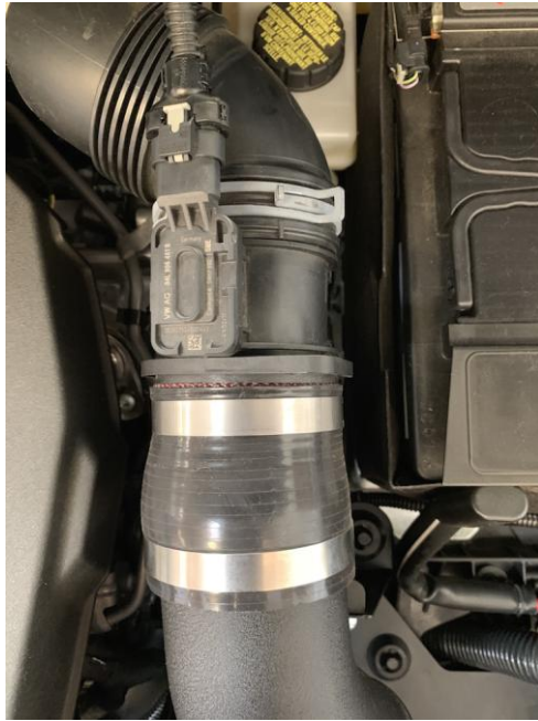
13. Install silicone hose; smaller end with #44 hose clamp towards MAF and larger end with #48 clamp towards intake pipe, then tighten clamps. Now reconnect MAF sensor electrical connection.