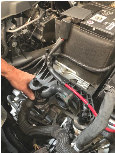
11. Pivot SAI hose to sit between the two front air box mounts.