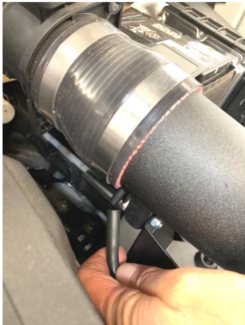
14. Connect vacuum line to port on NEUSPEED Intake Pipe.