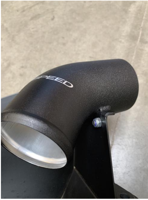
10. Mount NEUSPEED Intake Pipe to Heat Shield using M6x12mm bolts and lock nuts. Tighten with 4mm hex key wrench and 10mm wrench.