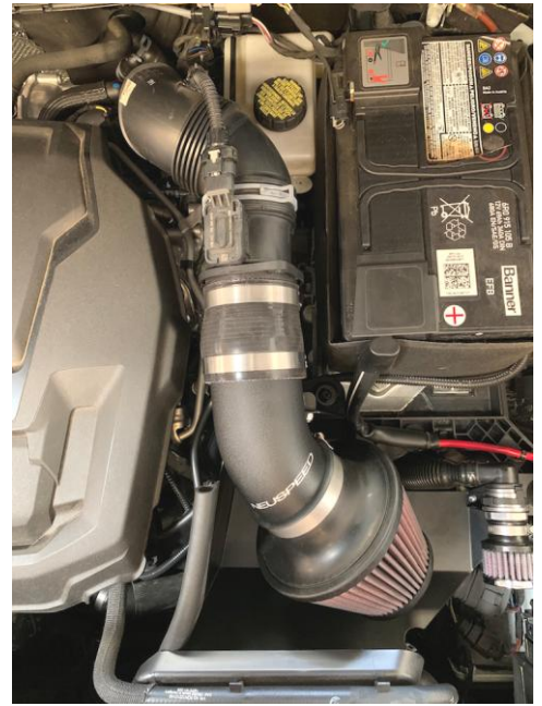
16. Install rubber strip on top-edge of NEUSPEED P-Flo Heat Shield.